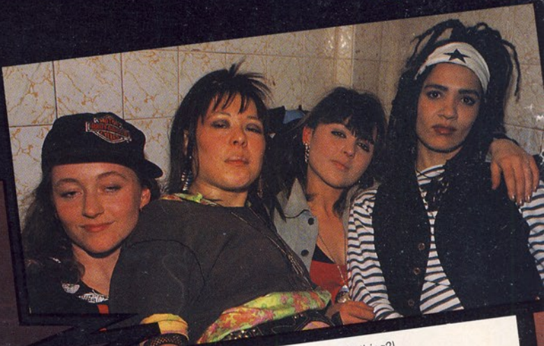
Krunch's krunchy front person (above)